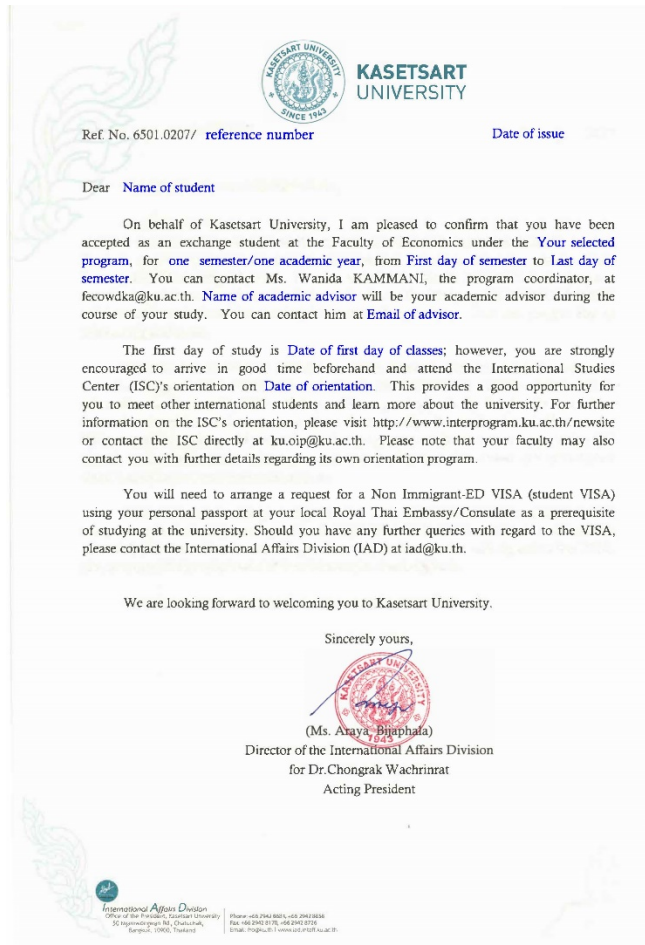
Example of Official Acceptance Letter