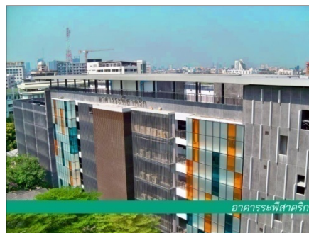
Rapee Sagarik Building

Exchange Students must visit the ISC Office on your first arrival day to register officially as a Kasetsart University Student. Please see what to do on first day for new students here .