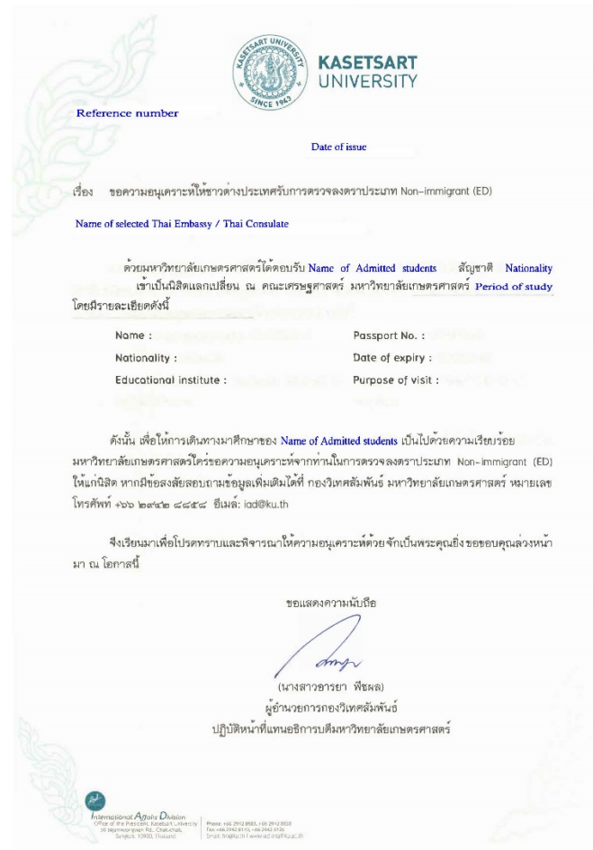
Example of Cover Letter to the Royal Thai Consulate