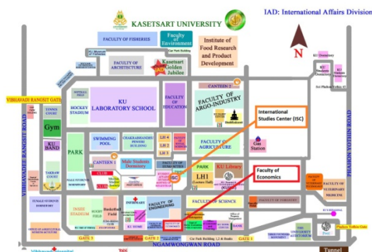
Faculty of Economics, KU Full size, click here

Website: http://ecia.eco.ku.ac.th/2019/?lang=en