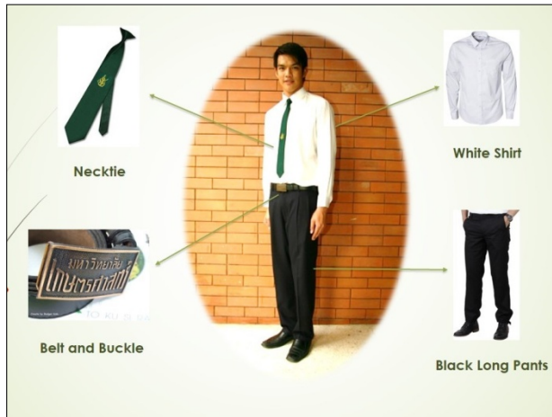
Male uniform for undergraduate students