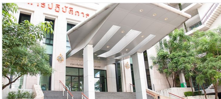
Economics Laboratory Building The ECIA office is on 2 nd floor