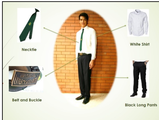
Male uniform for undergraduate students