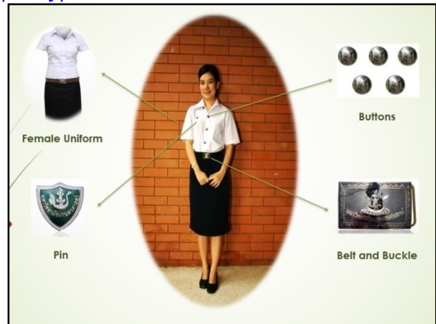
Female uniform for undergraduate students