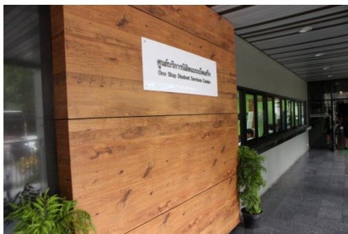
One Stop Student Services Center, 1 st floor, Rapee Sagarik Building

In order to make your Student ID Card, you need to wear proper student uniform (for undergraduate students only). The student ID card can be obtained at One Stop Service room, 1 st floor (ground floor), Rapee Sagarik Building (same building as ISC office).