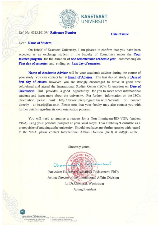
Example of Official Acceptance Letter