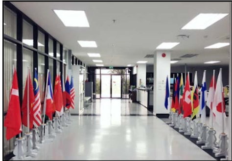
ISC Office, 6 th floor

International Studies Center (ISC) is the administrative office that coordinates international education activities, offers cultural training, assists with Visa extensions, and generally advises and facilitates visiting International Students. ISC is located in the Rapee Sagarik Building, (Office of the Registrar) on the 6 th floor.