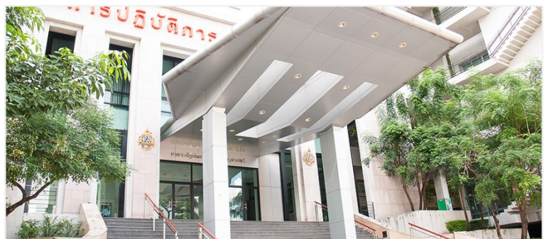
Economics Laboratory Building The ECIA office is on 2 nd floor