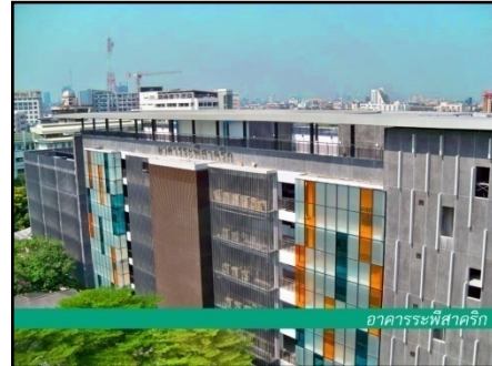
Rapee Sagarik Building

Exchange Students must visit the ISC Office on your first arrival day to register officially as a Kasetsart University Student.