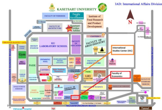
Faculty of Economics, KU Full size, click here

Website: http://ecia.eco.ku.ac.th/2019/?lang=en